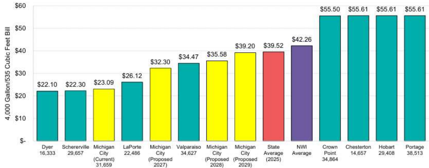
Comparison of Water Monthly Rates Northwest Indiana (NWI) Communities with a Population Range of 10,000 to 50,000 Includes Public Hydrant Surcharges (Based on 4,000 Gallons/535 Cubic Feet)